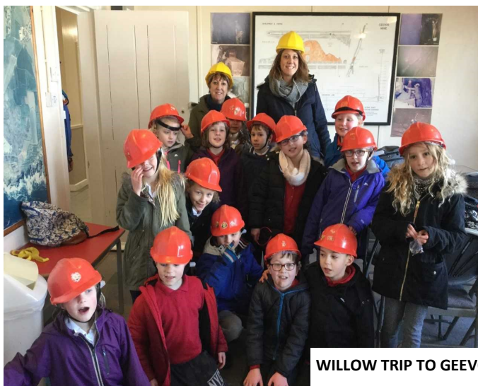
WILLOW TRIP TO GEEVOR MINE