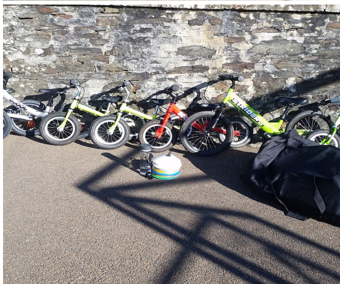
APPLE CLASS BALANCE BIKE STARS

Children from Apple Class have been taking part in balance bike training over the last few weeks with the last session this Monday.