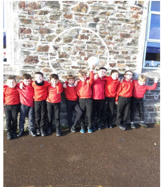
YEARS 3 AND 4 FOOTBALL TEAM

Our netball and football teams latest fixture at Tywardreath School had to be cancelled recently due to waterlogged pitches, hopefully this fixture will be re-scheduled soon.