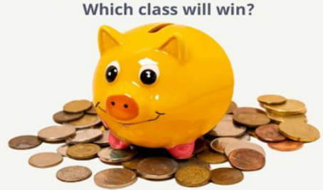
All proceeds will benefit Lostwithiel School

Each class has their own pig for collecting money. The children can add money to their pigs at anytime as their pig will live in the classroom, encourage your child to earn the pennies by helping at home! The Piggys will also appear at whole school events.