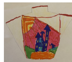
Eid Lanterns made by Inigo (Oak Class)