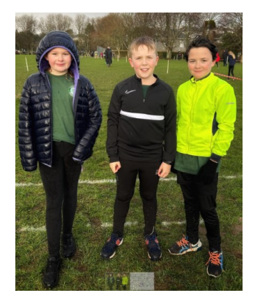
Our year 6 cross-country children braved the weather last week at Par running track