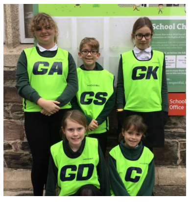
Year 5 and 6 netball team: The team have said they love how supportive their teammates are, they like how everyone works so well together and they come to netball to work hard as a team and have fun!